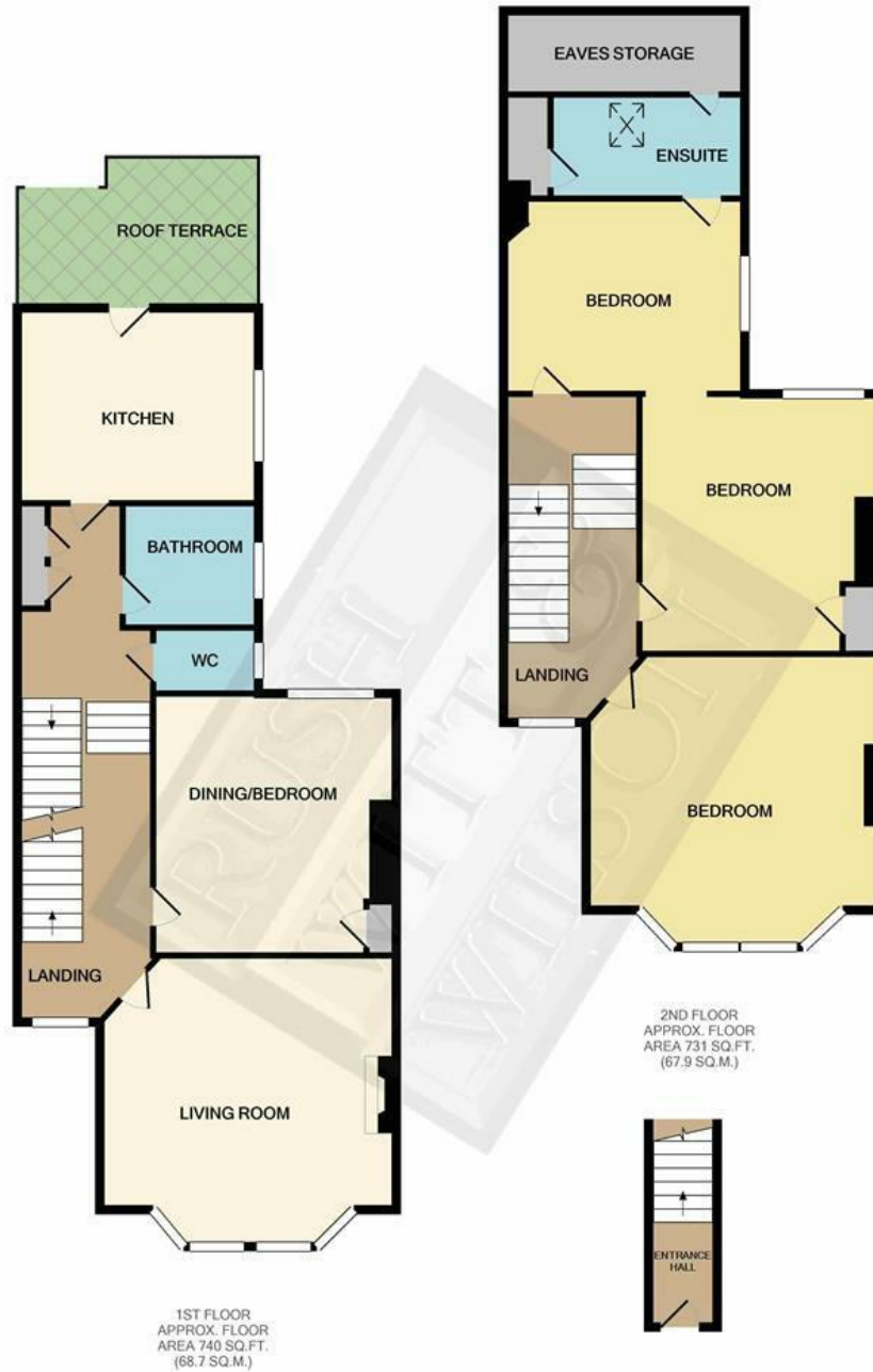
1ST FLOOR APPROX. FLOOR AREA 740 SQ.FT. (68.7 SQ.M.)